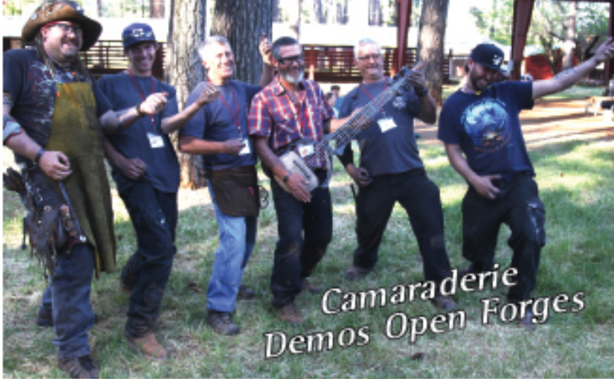
Camaraderie Demos Open Forges

Right HERE... see this is where you NEED to be!